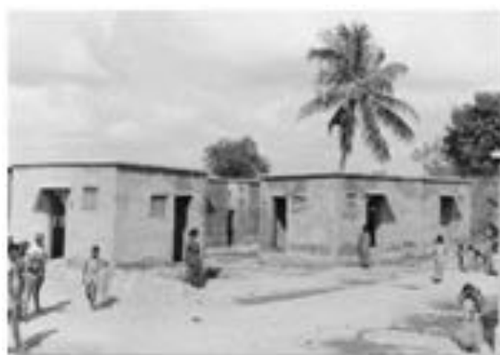
Oikocredit's early microfinance activities, India, 1978

Poverty and its associated challenges were thus the lenses (not religion) which united these diverse Christian traditions wanting to apply their faith to purpose and action through the instrument of investment.