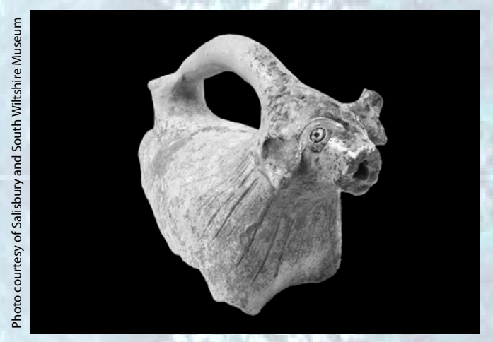
A medieval pourer used for serving water during meals

Organised by the Alliance for Religions and Conservation (ARC), the Ecological Management Foundation (EMF) and the International Water and Sanitation Centre (IRC).